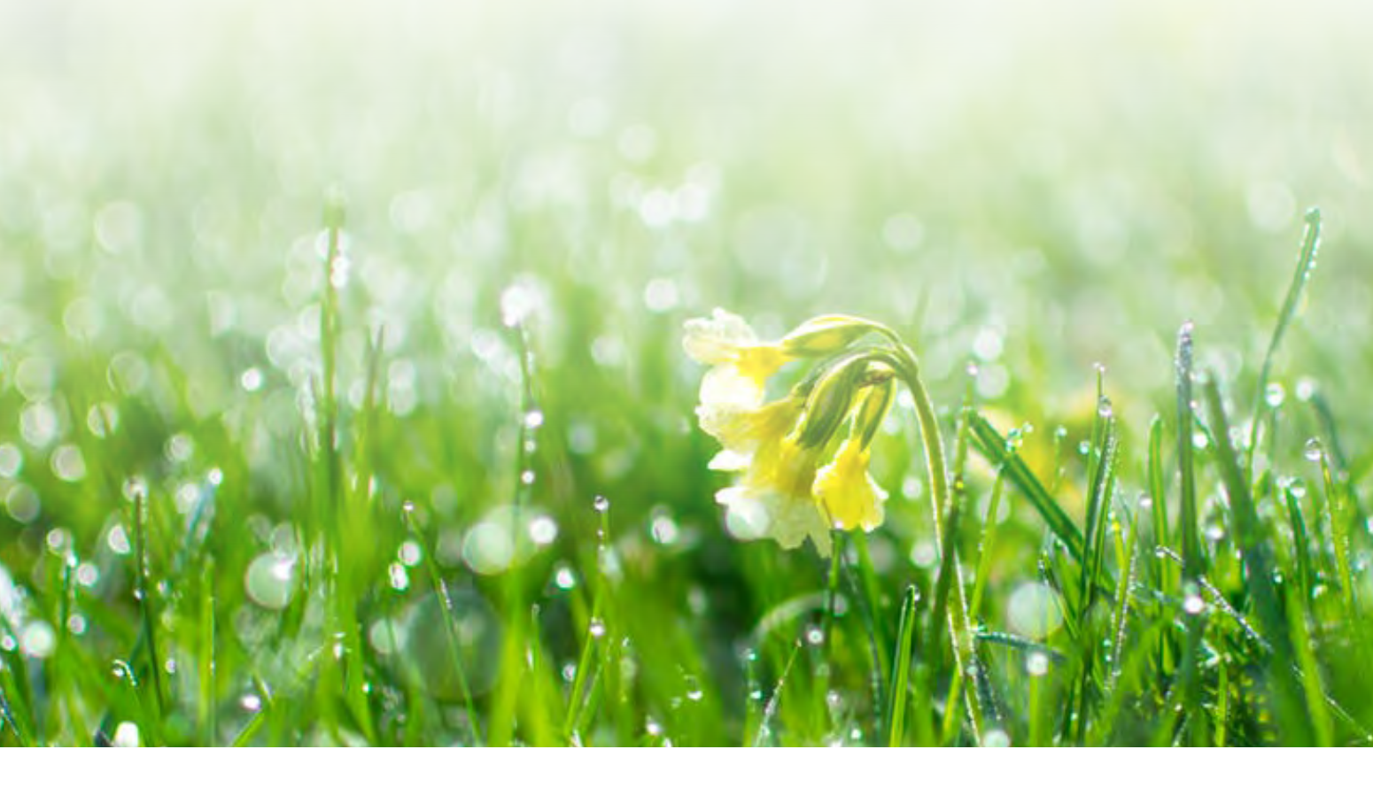
For the year ended 31 December 2018